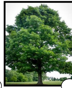
SWAMP WHITE OAK